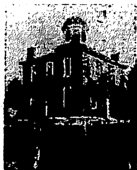
Dickson County Courthouse